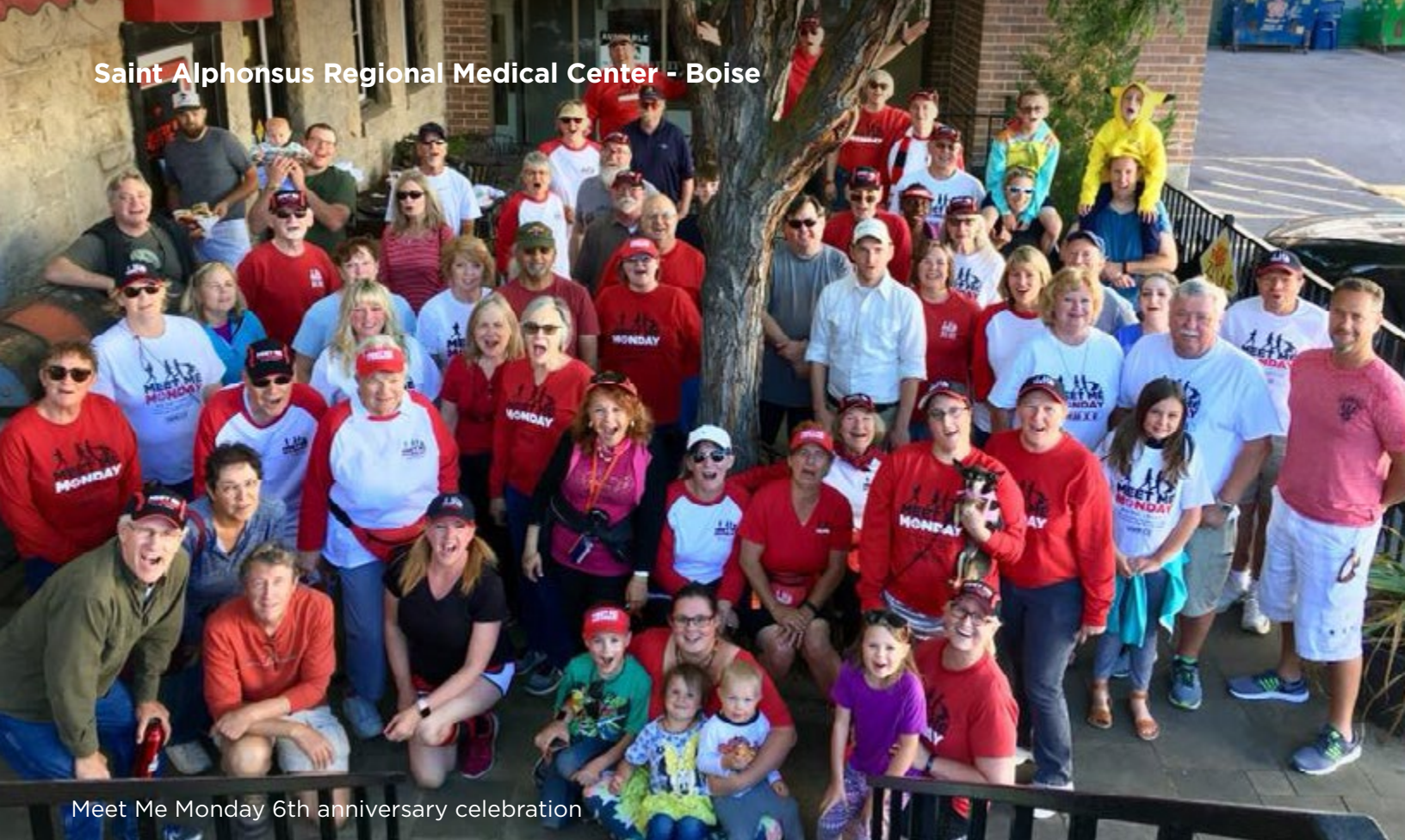
Meet Me Monday 6th anniversary celebration

developed for communities to establish their own walking program. In FY19, 1,000 people were served. SARMC provided education and outreach on healthy habits at community events, such as the Boise downtown farmer's market.