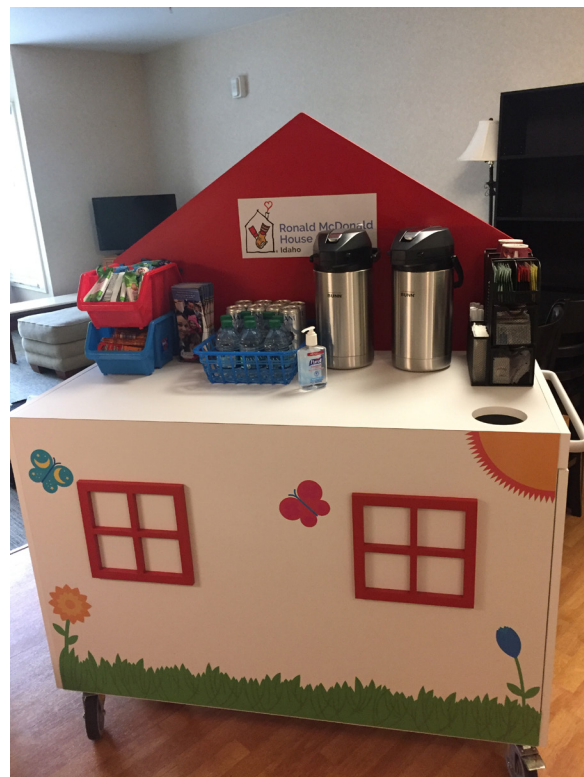
Happy Wheels Hospitality Cart